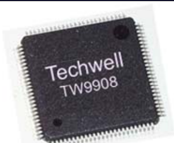
Techwell's TW9908 100-pin PQFP package

A 2-wire serial MPU interface is used to simplify system integration. All the functions can be controlled through this interface.